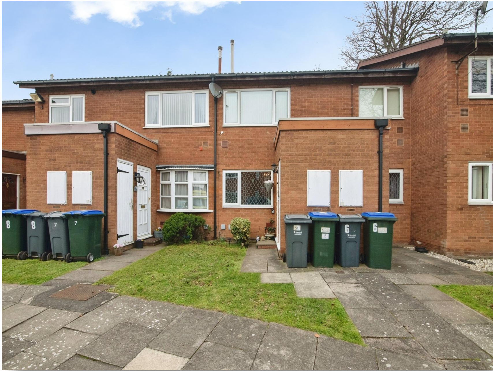
High Beeches, Birmingham B43 6AQ