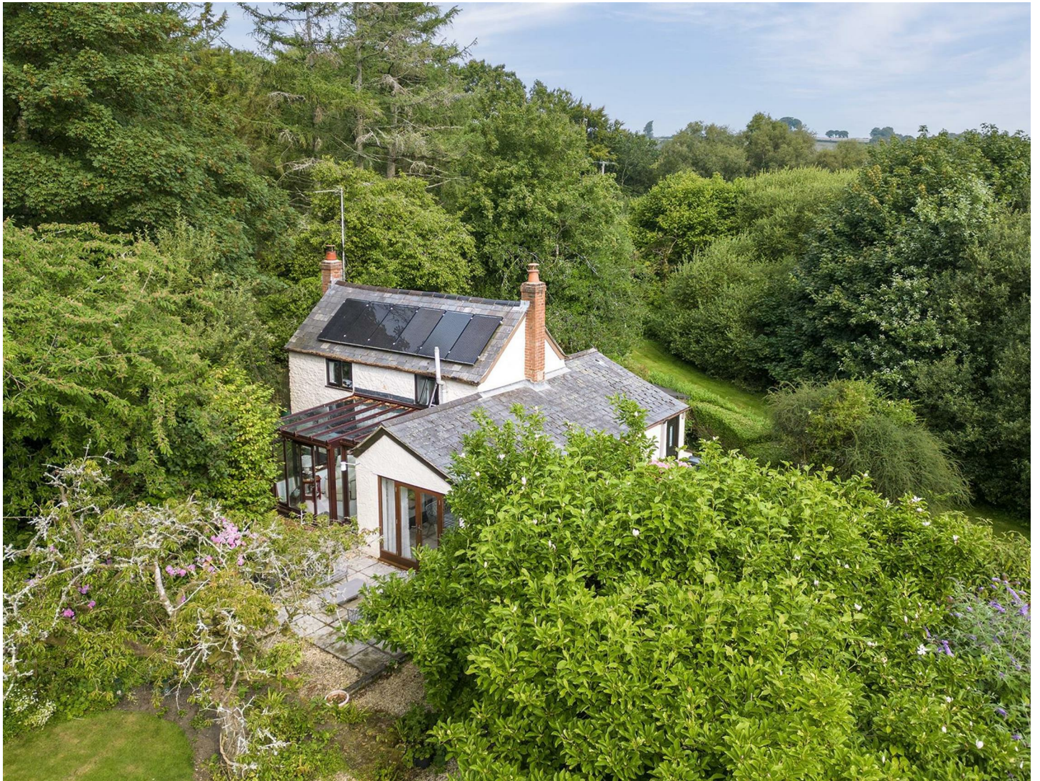
Lane End Cottage