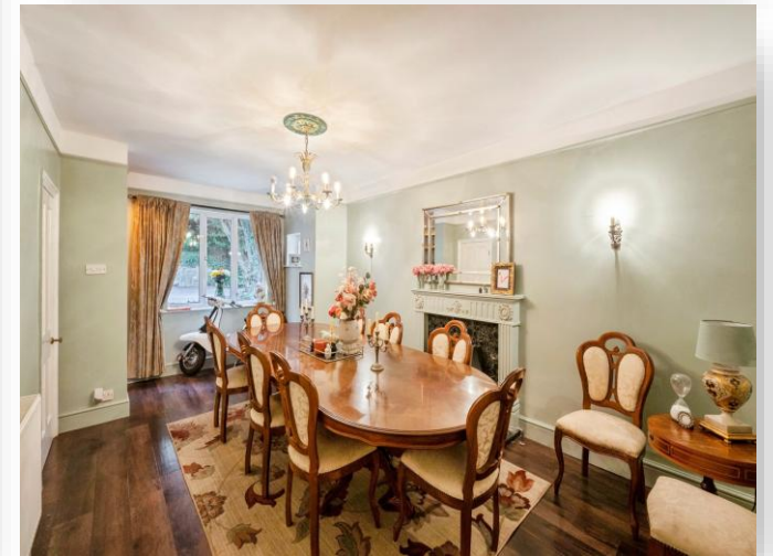
Kathlyn Villa Low Road, Conisbrough Doncaster DN12 3ER