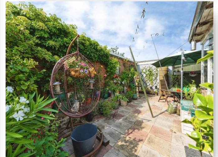
Green Park, Chatteris PE16 6DJ