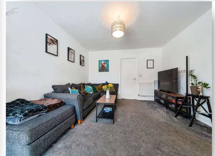
Sandringham Way, Sleaford NG34 6AB