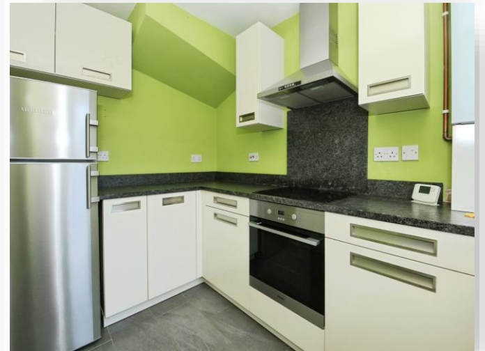
Glebe Road, Stilton Peterborough PE7 3RQ