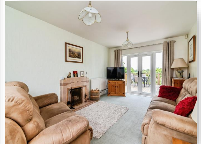
Lothian Road, Tollerton Nottingham NG12 4EH