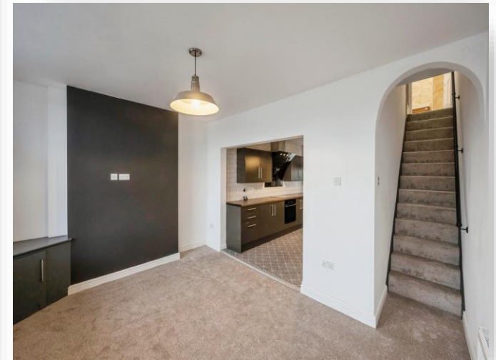
Victoria Street, Goldthorpe Rotherham S63 9HS