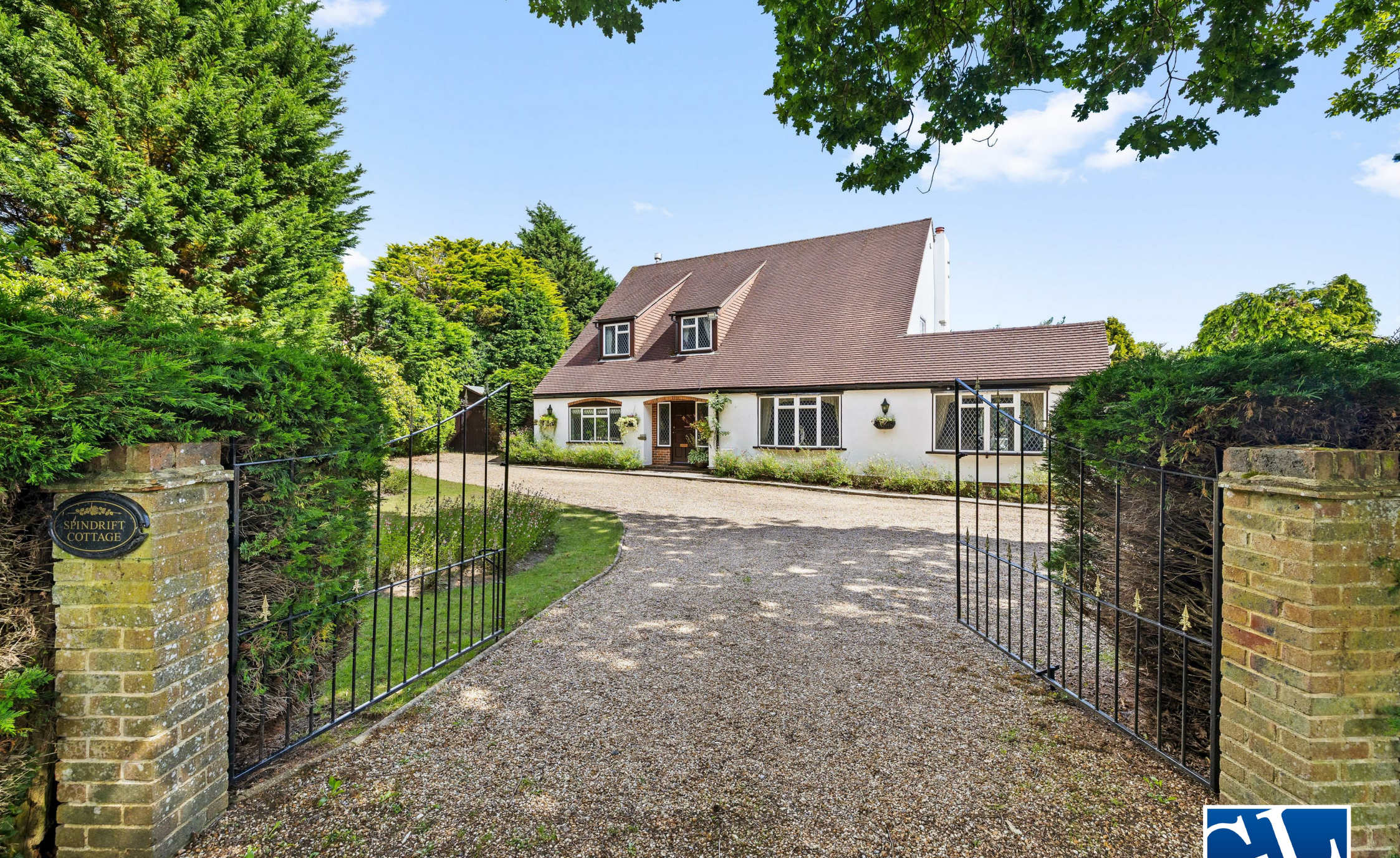
Spindrift Cottage, Nyetimber Lane, West Chiltington, West Sussex RH20 2ND