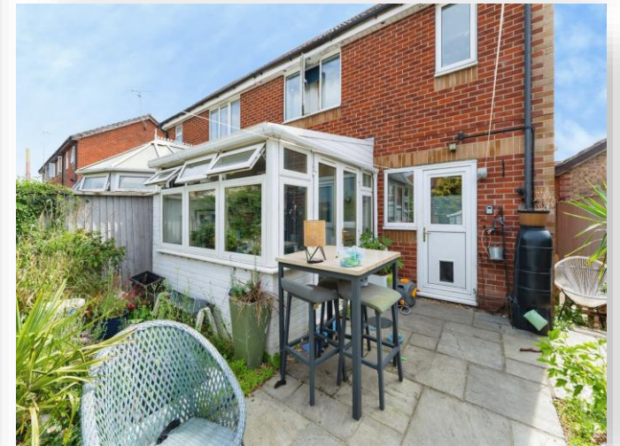
Gull Way, Chatteris PE16 6DT