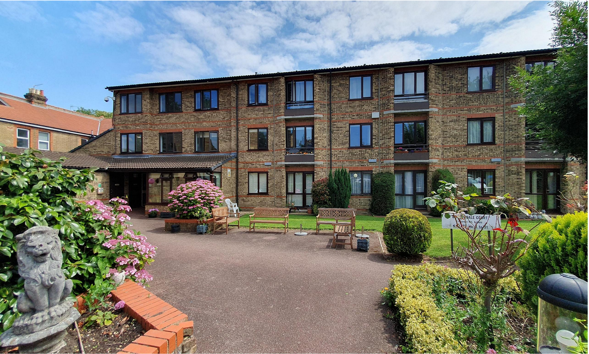
Borrowdale Court Gordon Hill, Enfield EN2 0QJ