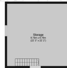
Garage First Floor Floor area 45.5 sq.m. (490 sq.ft.)

Total floor area: 249.52 sq.m. (2686 sq.ft.)