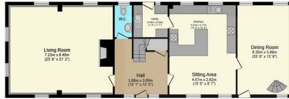
Ground Floor Floor area 114.9 sq.m. (1,237 sq.ft.)