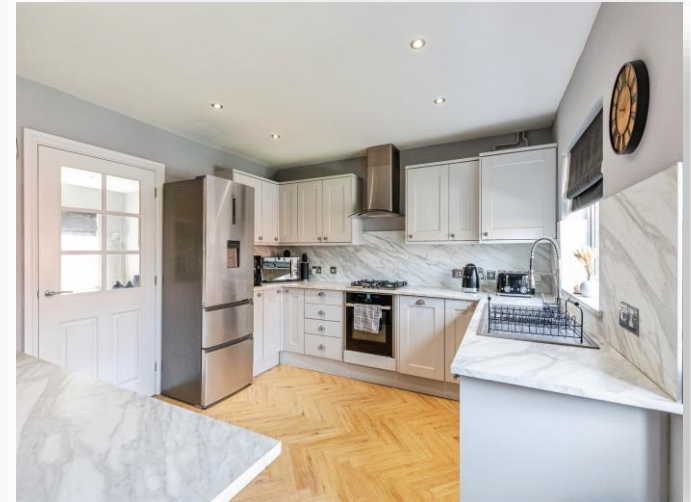
Thornbridge Close, Rushden NN10 9NJ