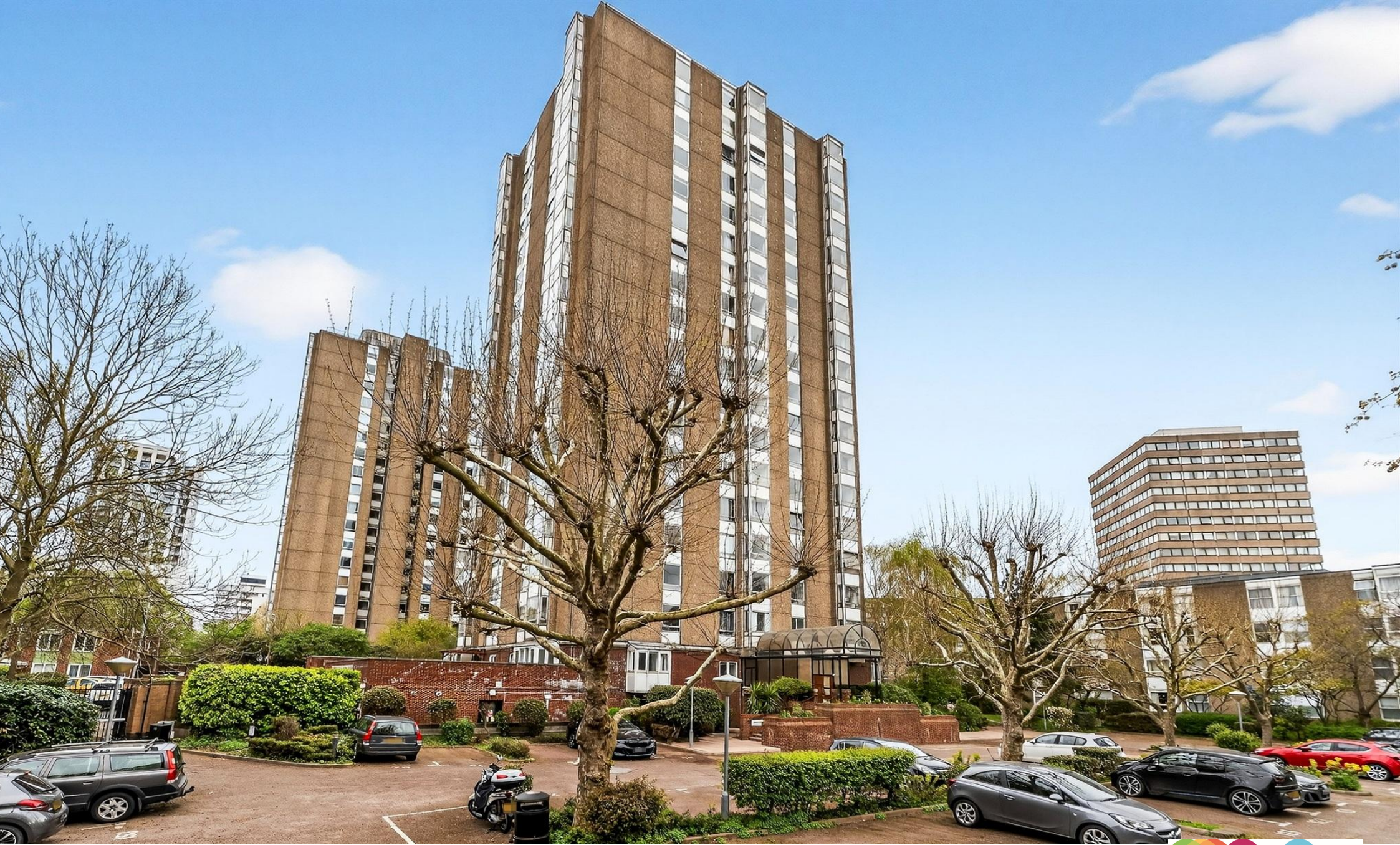
Eagle Heights Bramlands Close, London SW11 2LJ