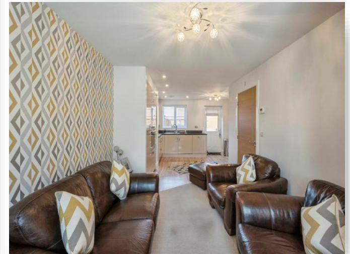
Comrades Place, Goldthorpe Rotherham S63 9GN