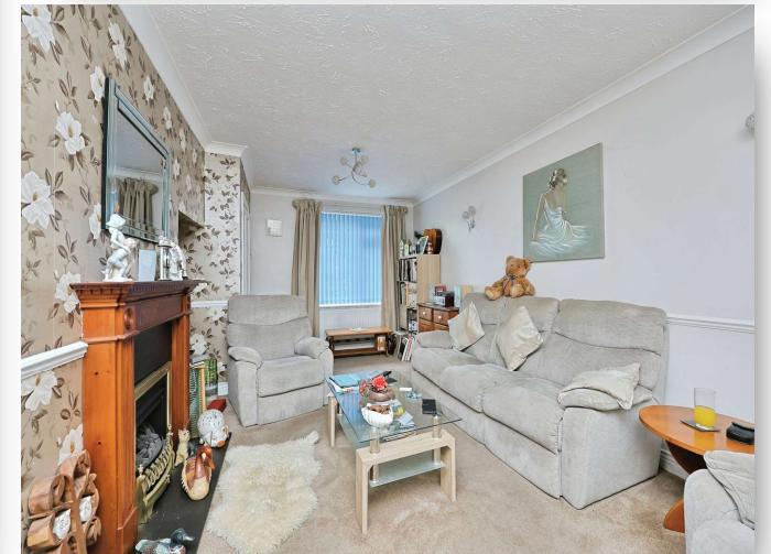
The Avenues, Norwich NR4 7DP