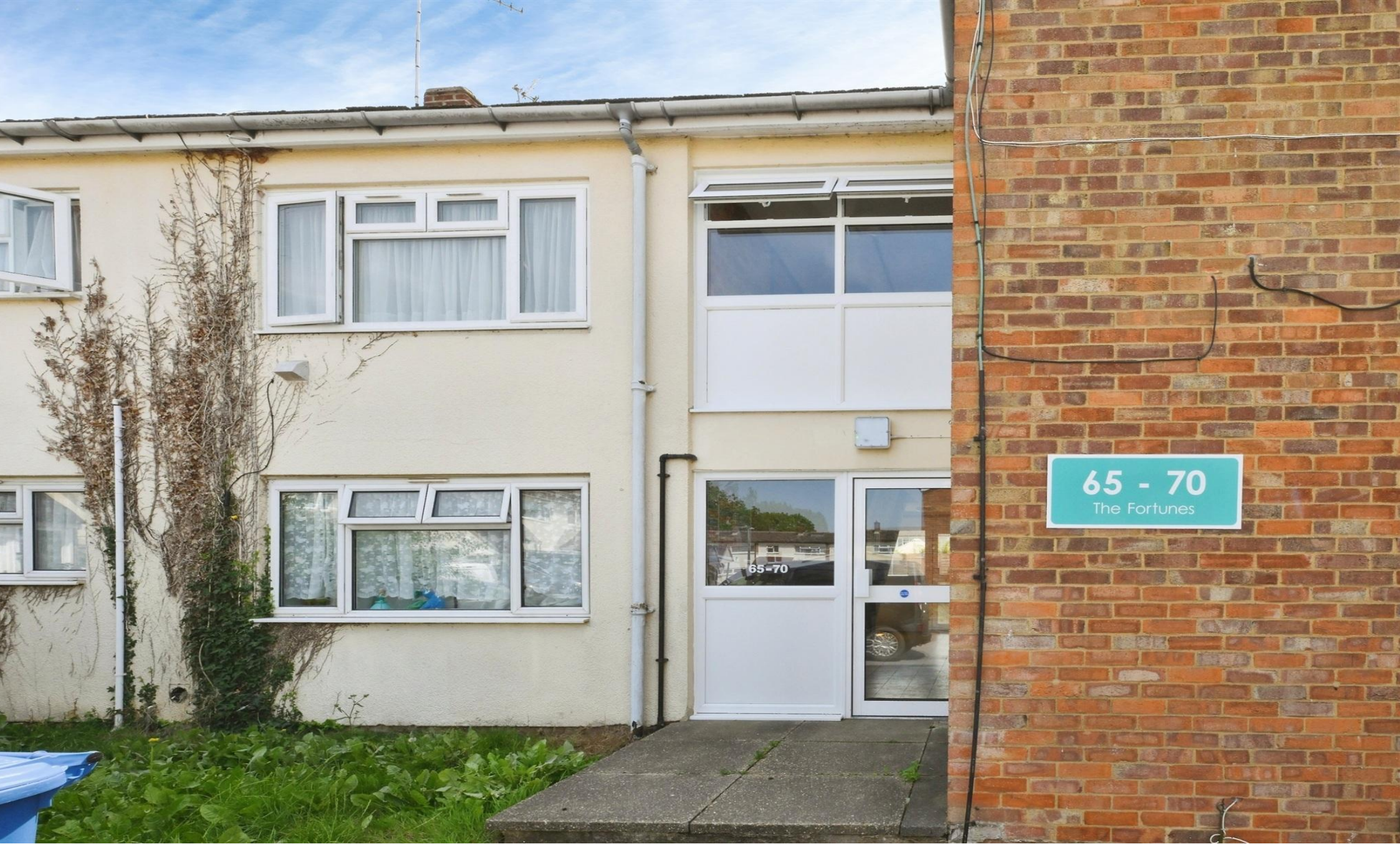
The Fortunes, Harlow CM18 6PH