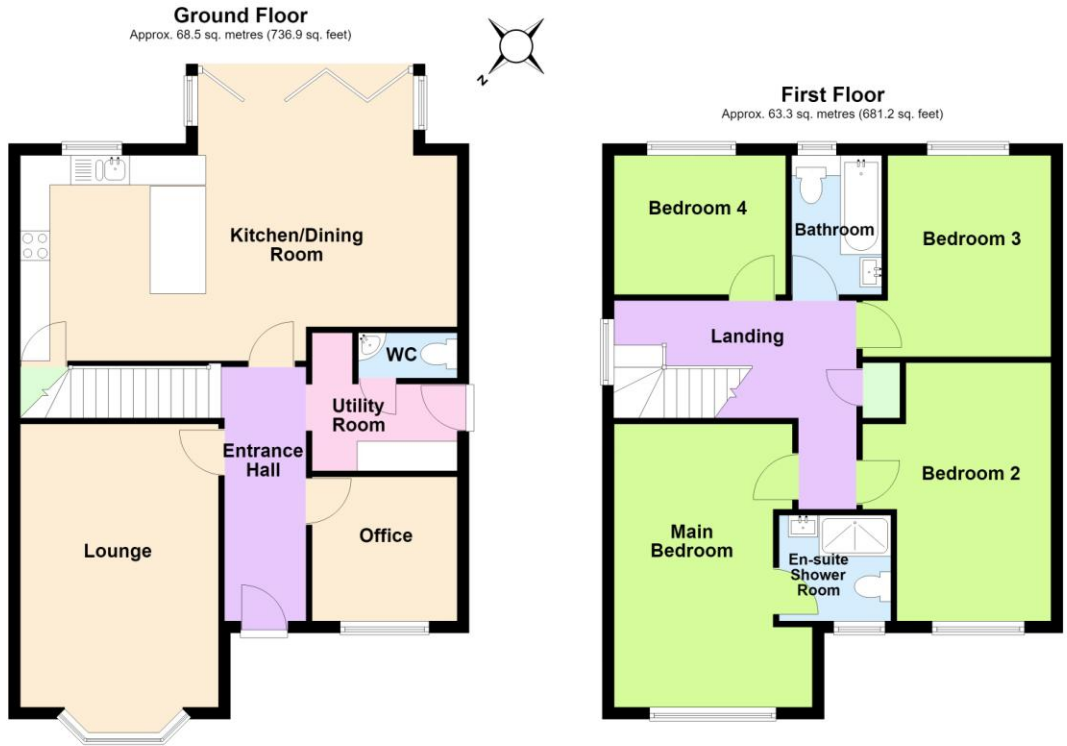
Total area: approx. 131.7 sq. metres (1418.1 sq. feet)