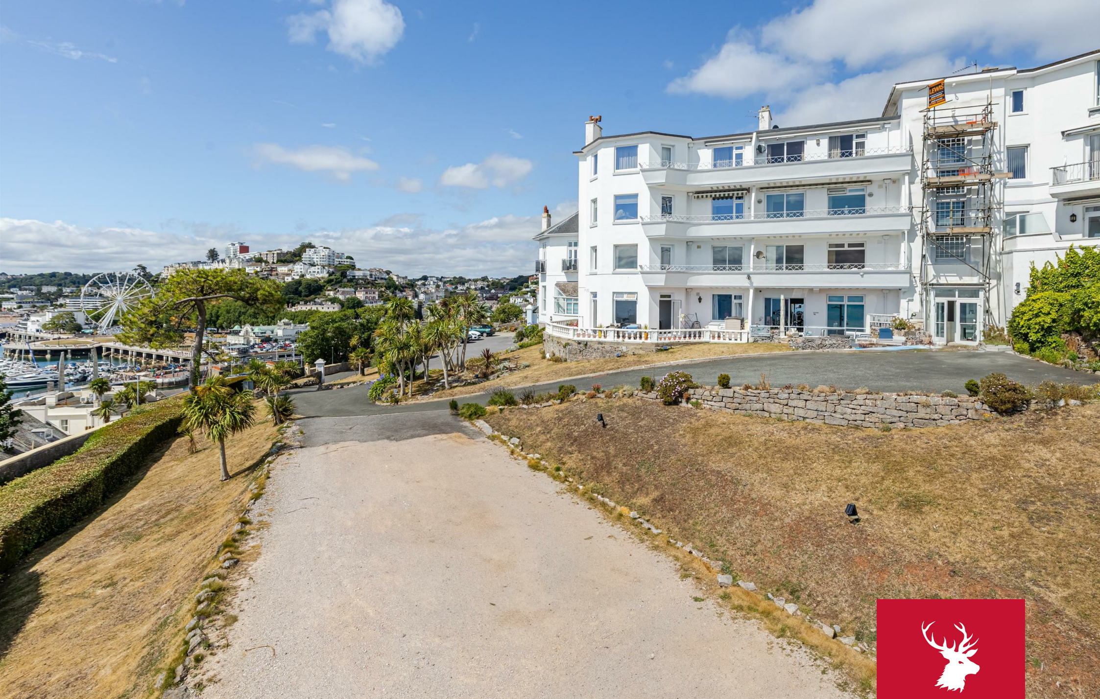
7 Park Hall