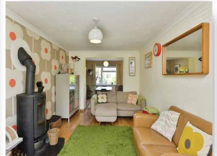
Breton, Stony Stratford Milton Keynes MK11 1DA