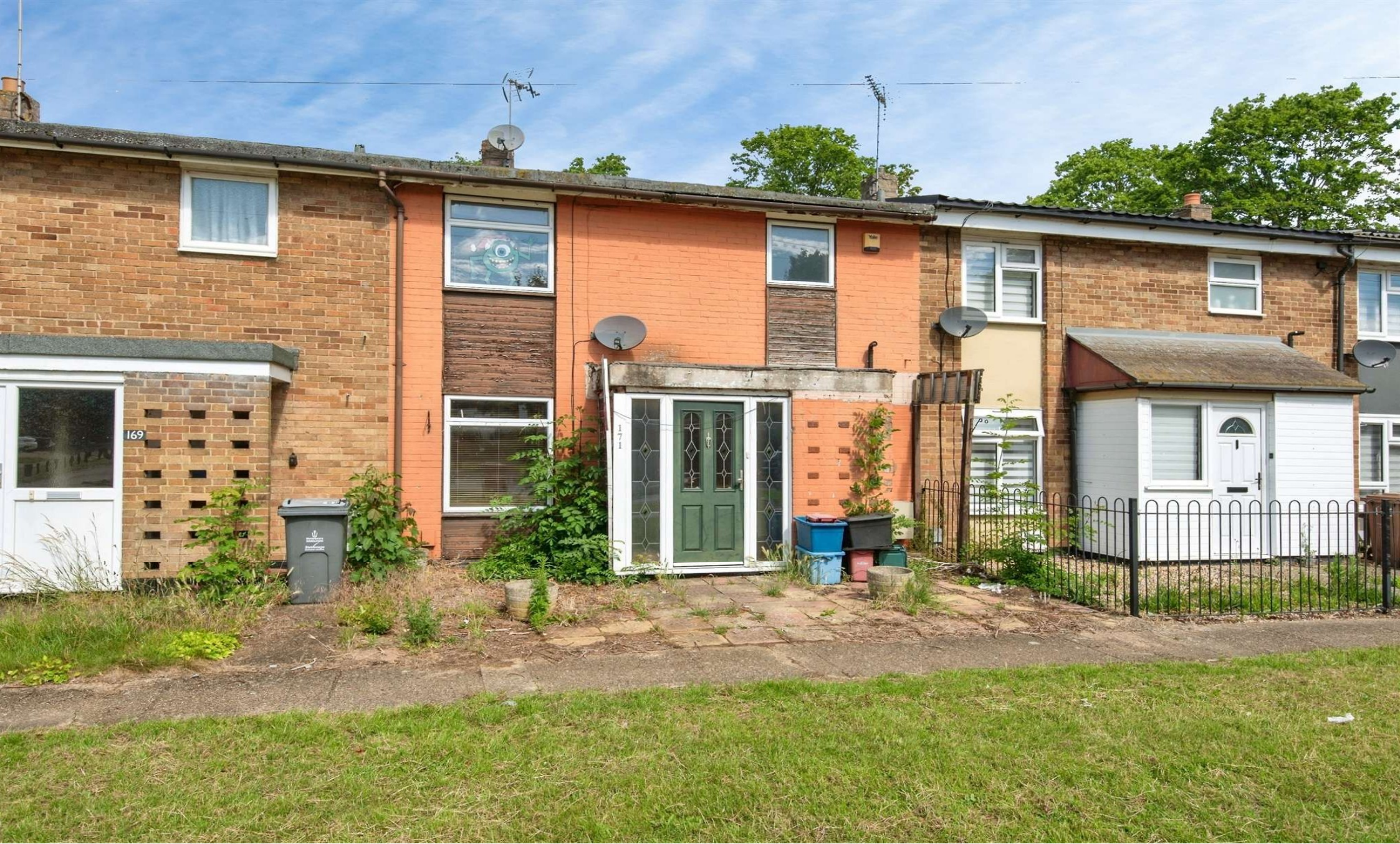
Bedwell Crescent, Stevenage SG1 1ND