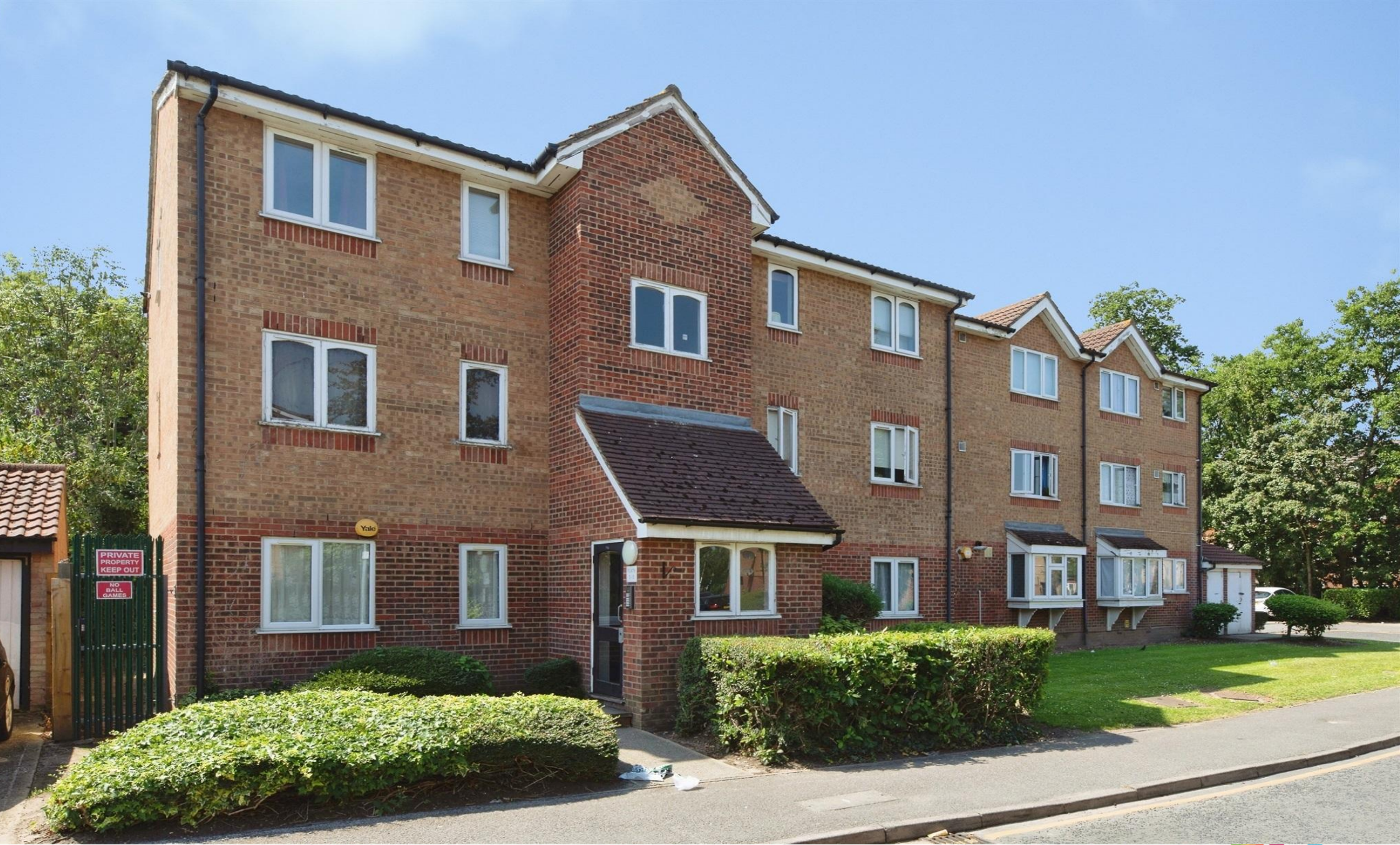
Fenman Gardens, Ilford, IG3 9QE