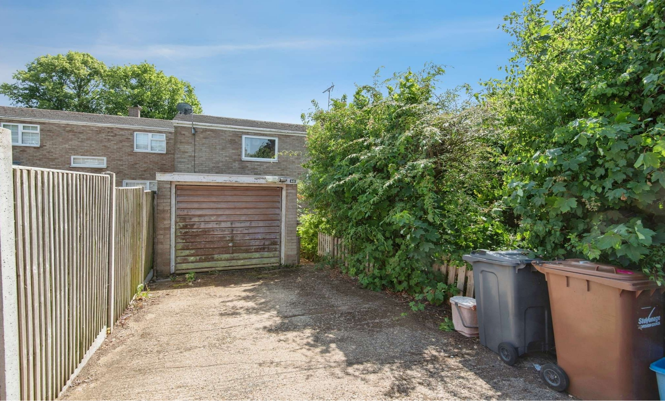
Grace Way, Stevenage SG1 5AB