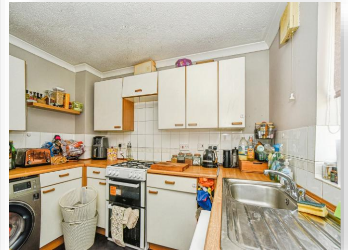
Water Mint Way, Calne SN11 0RT