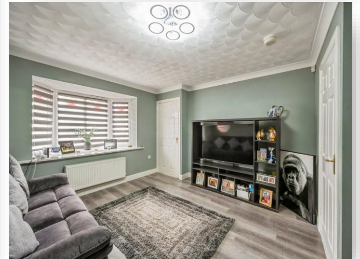
Loscoe Grove, Goldthorpe Rotherham S63 9GH