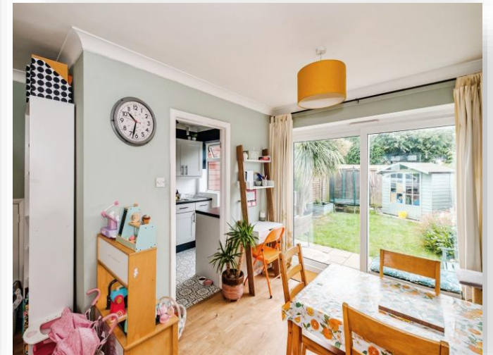
Abbotts View, Sompting Lancing BN15 0NG