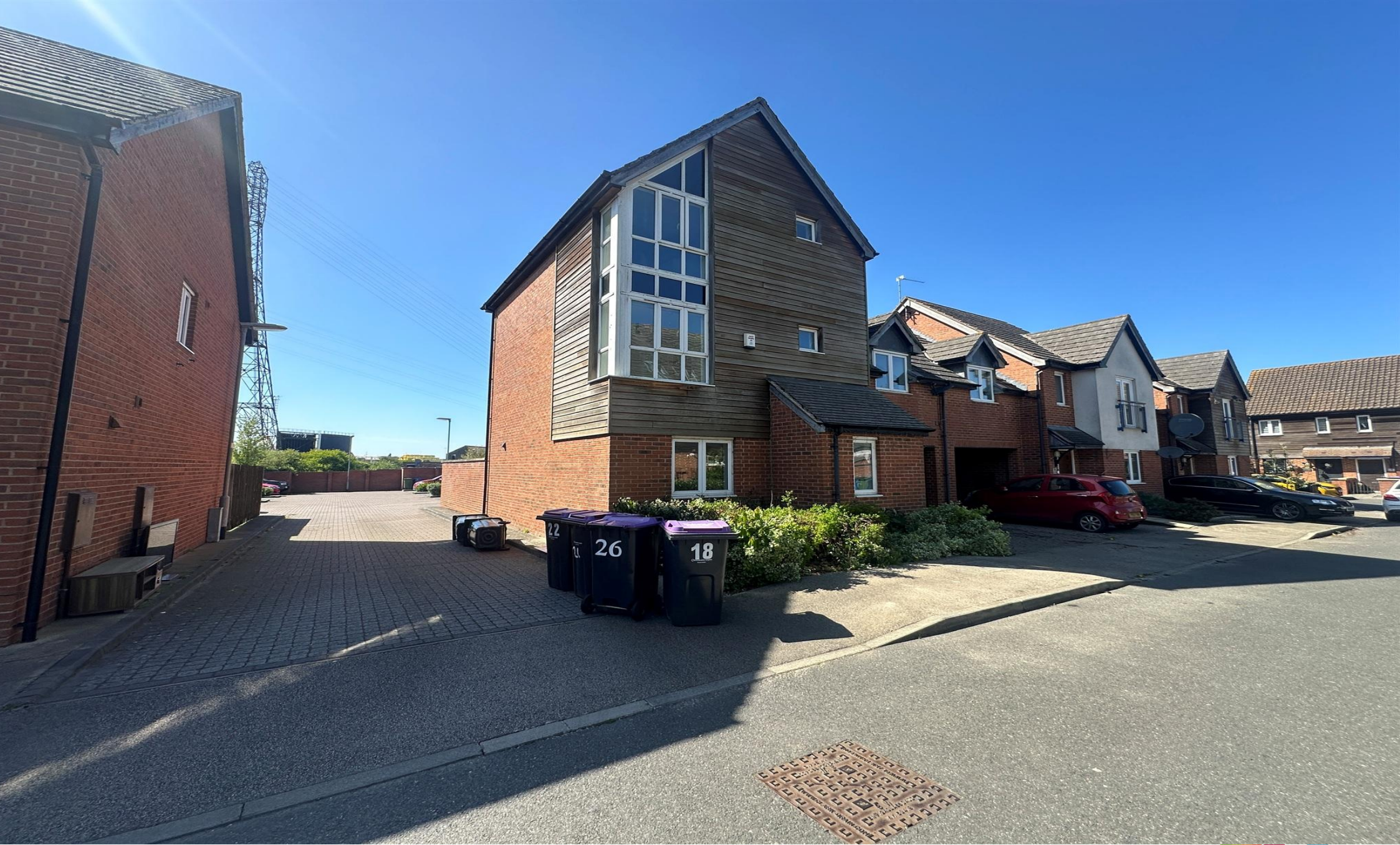
The Featherworks, Boston PE21 0AF