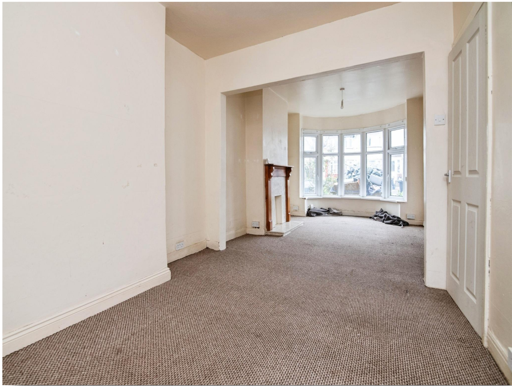
Sandringham Road, Birmingham B42 1PQ