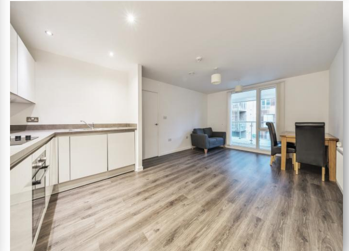
Flat 9 Trent House, 5 Kidwells Close, Maidenhead SL6 8FU