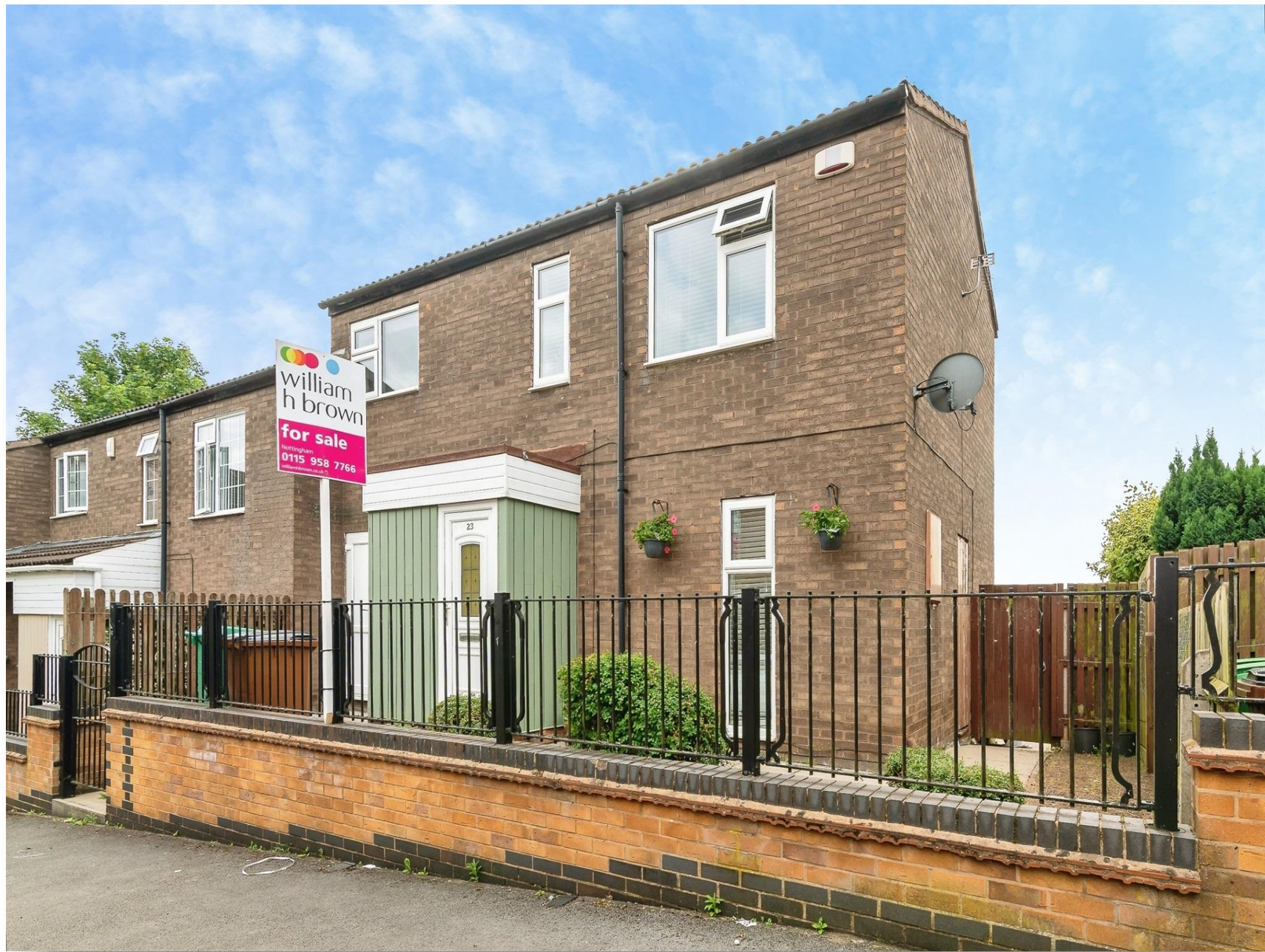
Welbeck Walk, Nottingham NG3 1AL