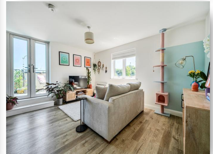
Apartment 33 Hythe Lodge, 157 Boyn Valley Road, Maidenhead SL6 4GB