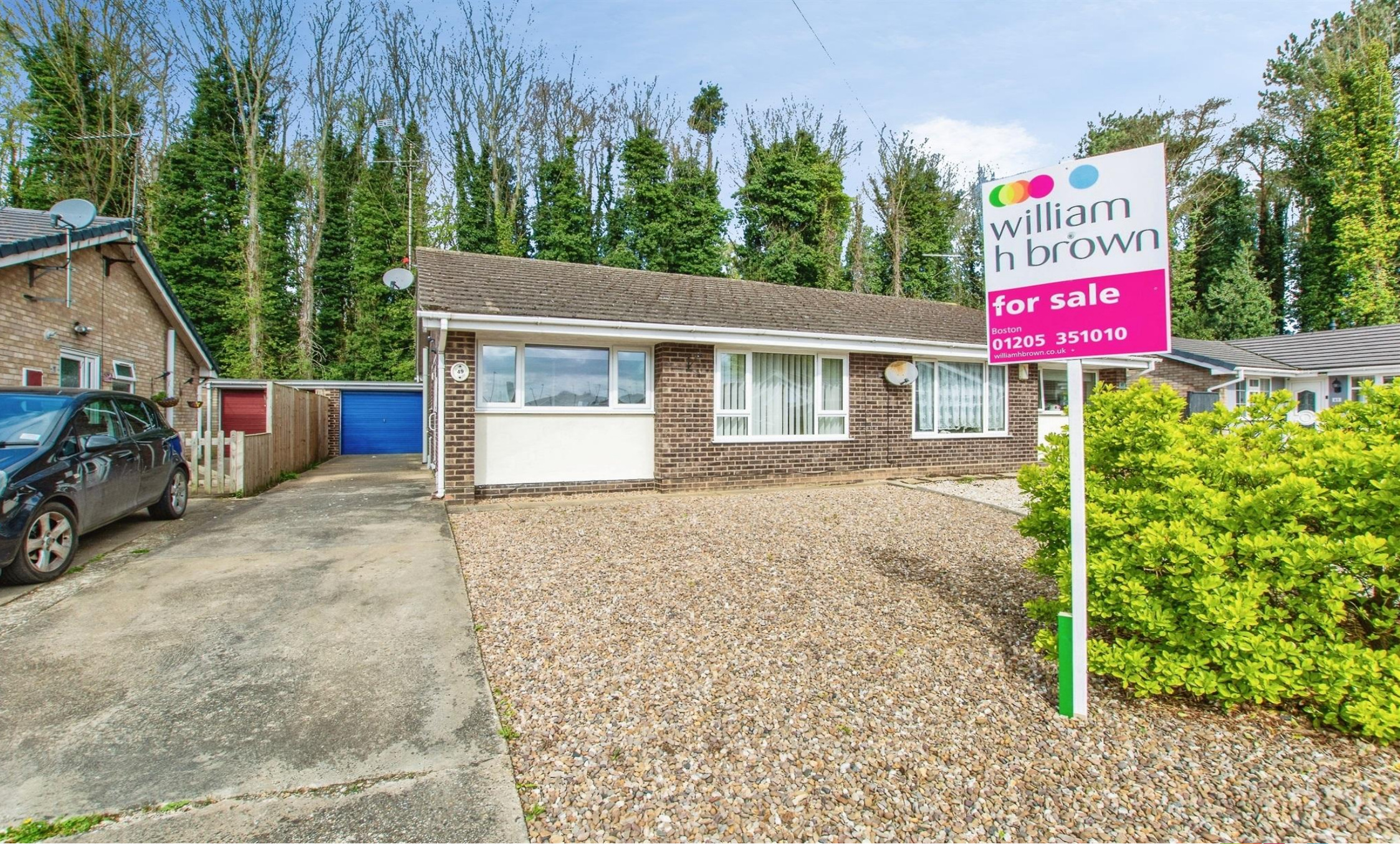
Oak Crescent, Boston PE21 9EZ