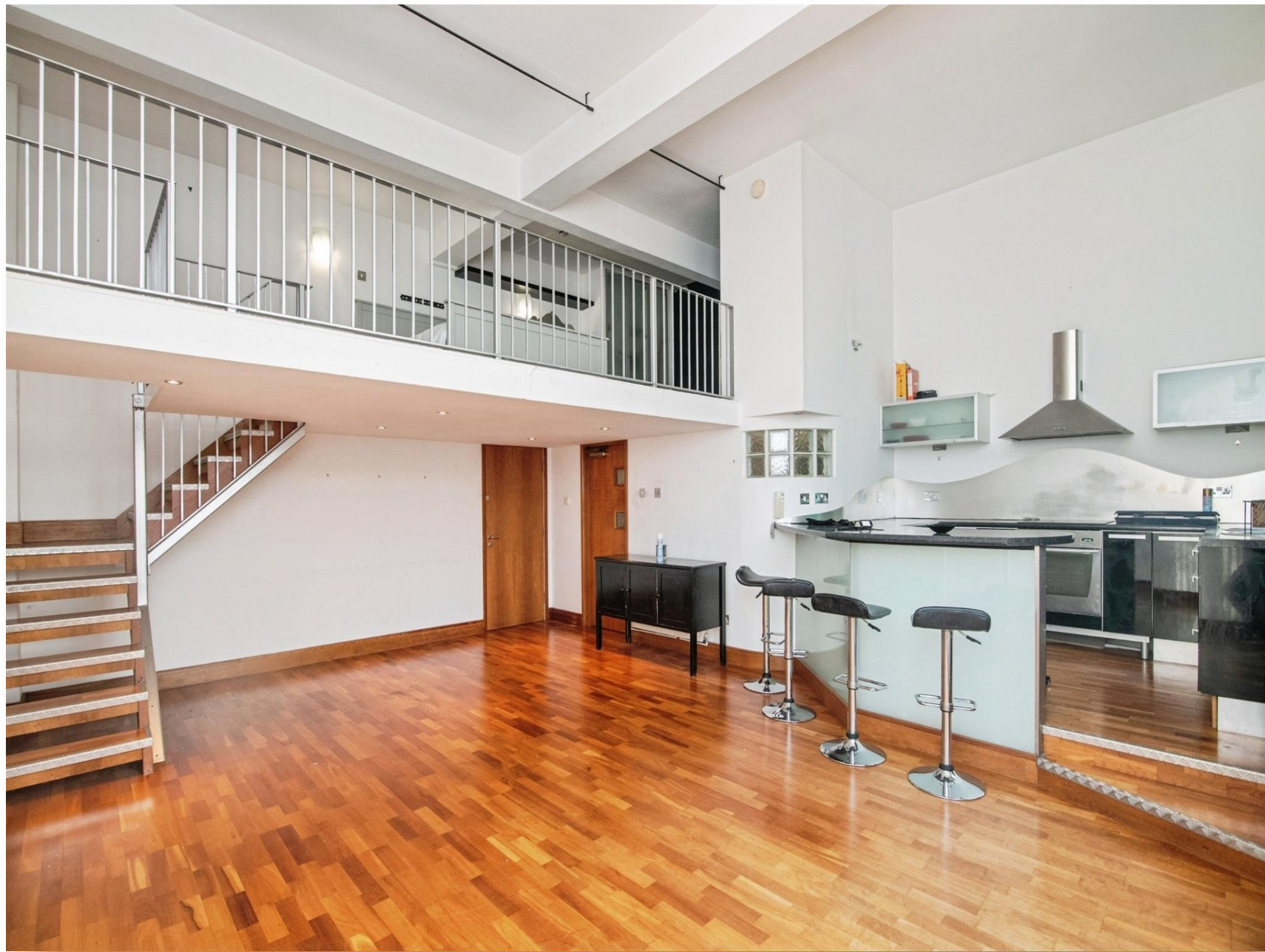
Metropolitan Lofts Parsons Street, Dudley DY1 1JE