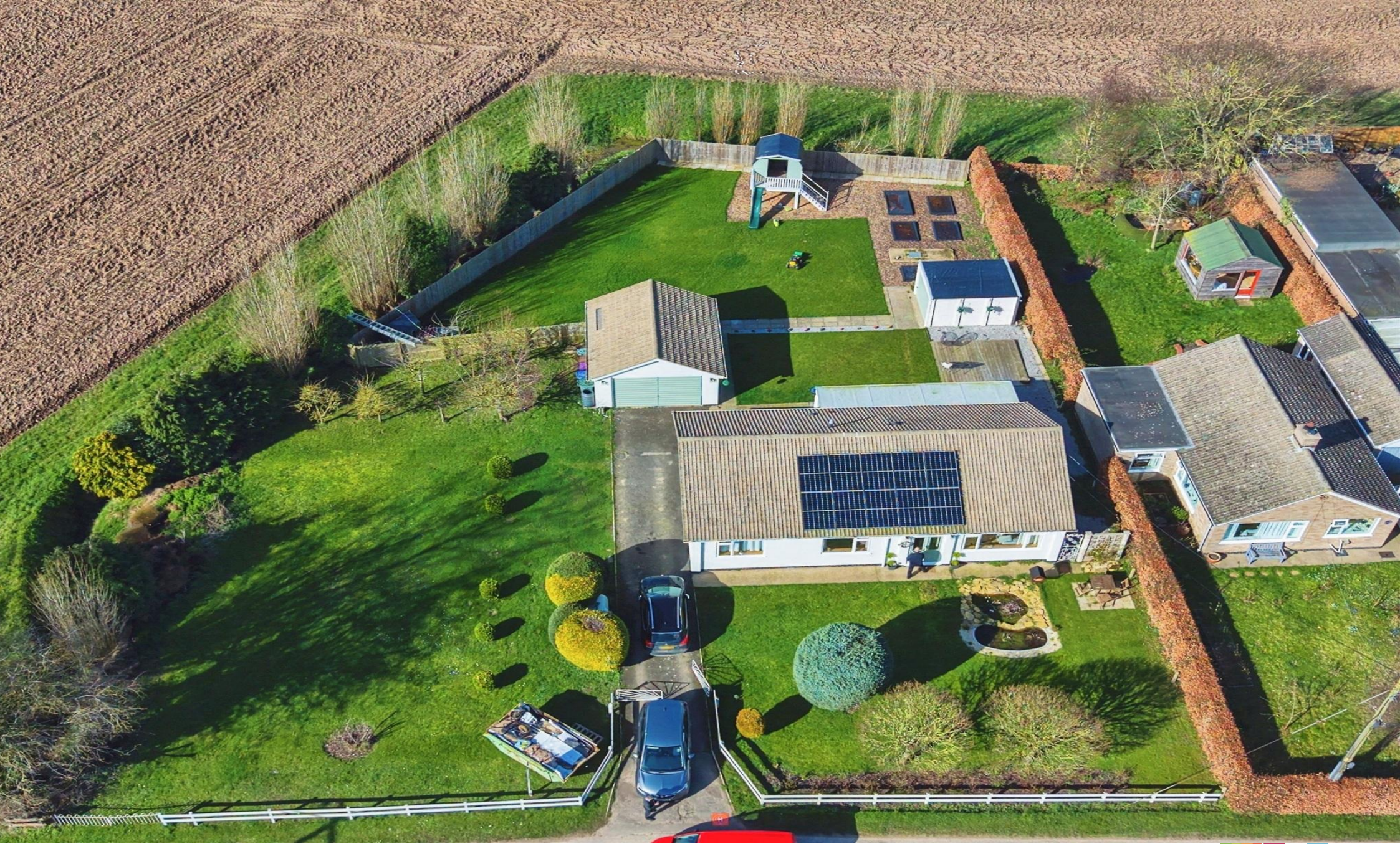
The Mallard Marsh Road, Kirton BOSTON PE20 1LY