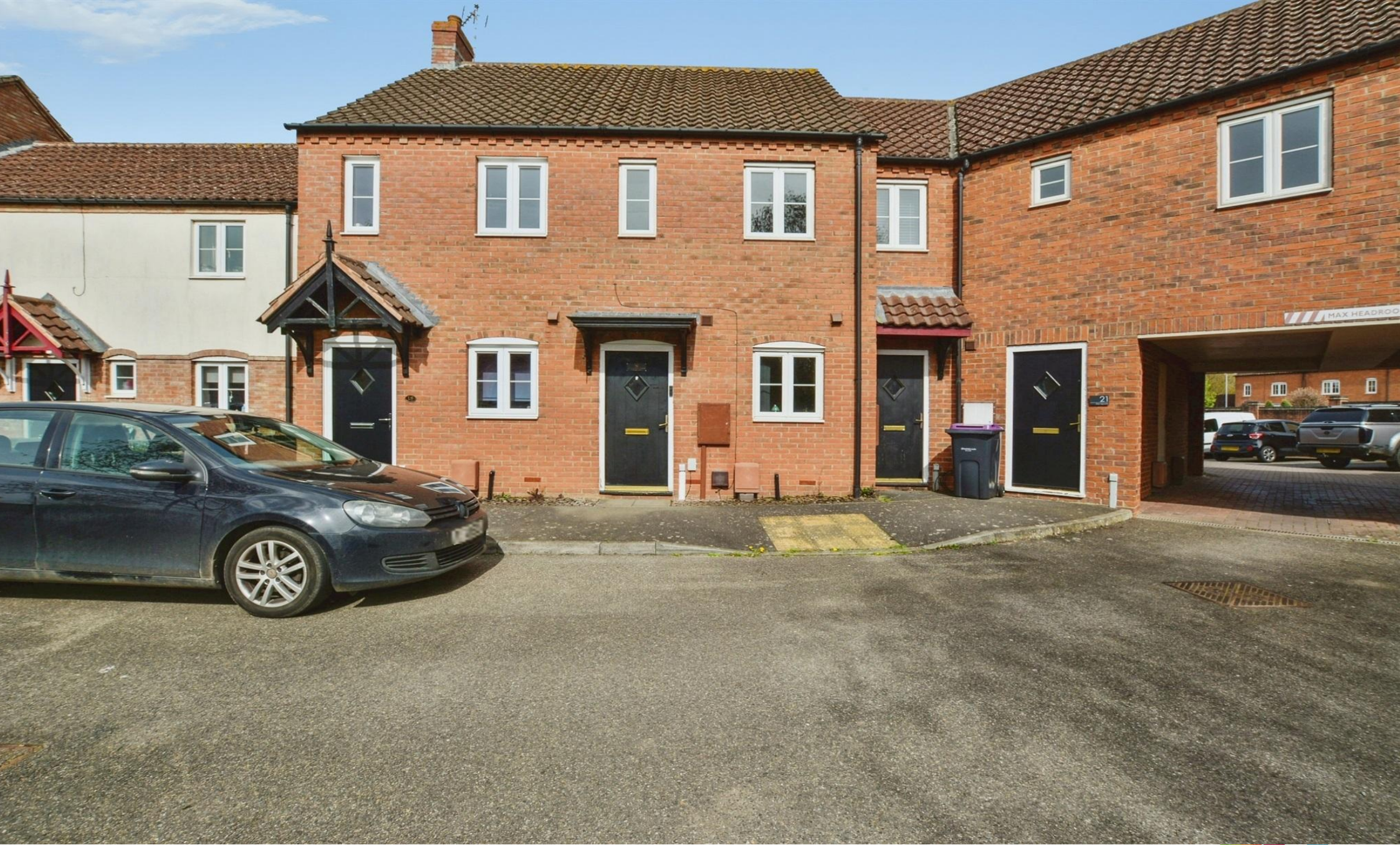
The Square, Kirton Boston PE20 1HT