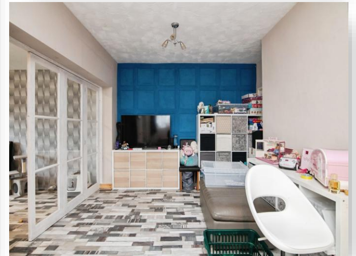
Kenelm Road, Oldbury B68 8PF