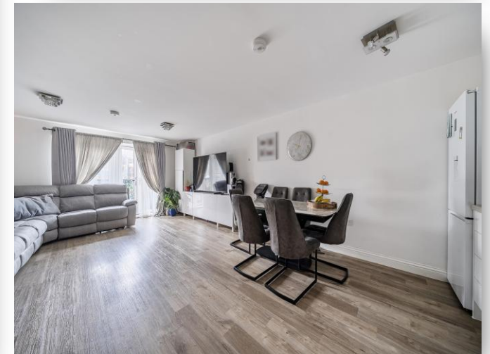
Apartment 25 Hythe Lodge, 157 Boyn Valley Road, Maidenhead SL6 4GB