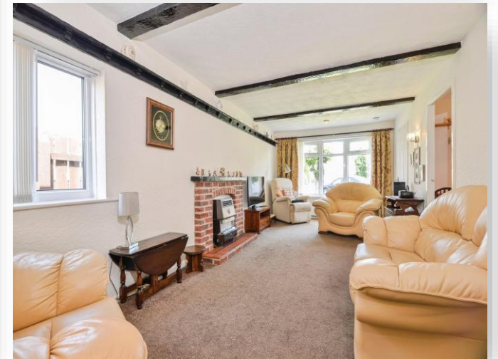
Hickling Grove, Stockton-On-Tees TS19 0XA