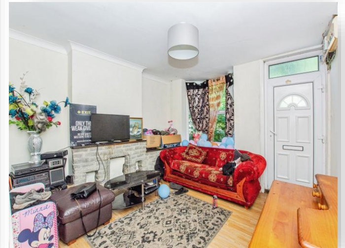
Marsh Walk, Wisbech PE13 2DR