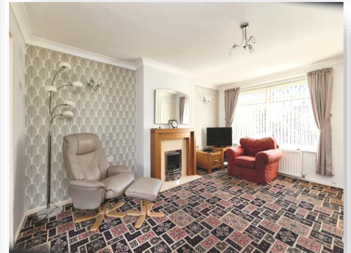
Westbeck Gardens, Middlesbrough TS5 6RY