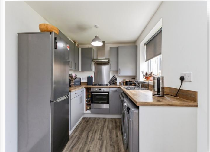
Brookes Lane, Hemlington Middlesbrough TS8 9GE