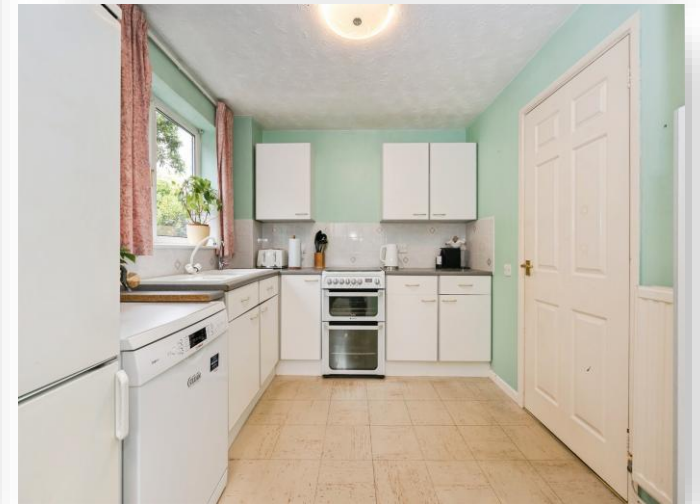
Welland Gardens, West End Southampton SO18 3PT