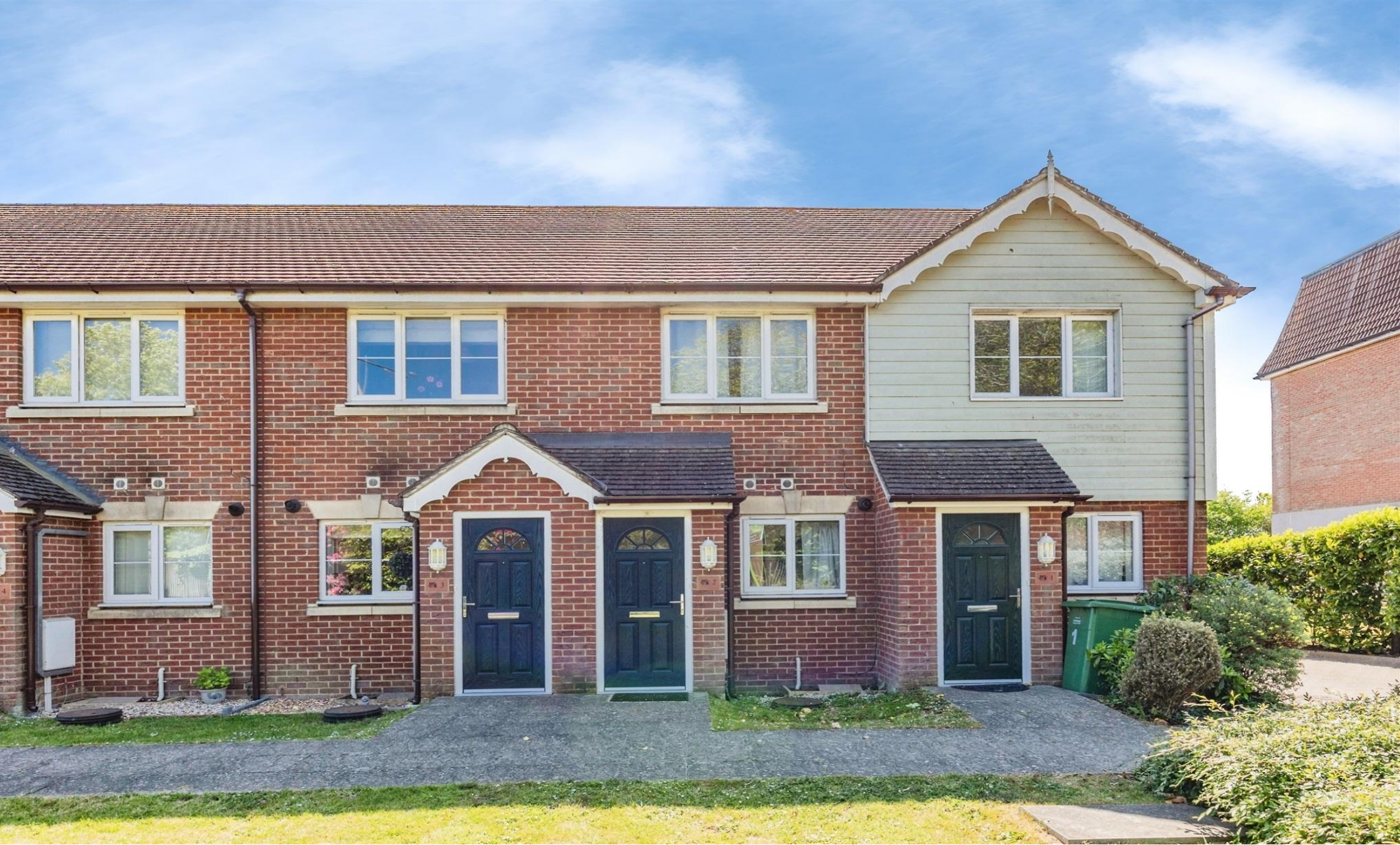
Seacrest View, Hastings TN34 2FA