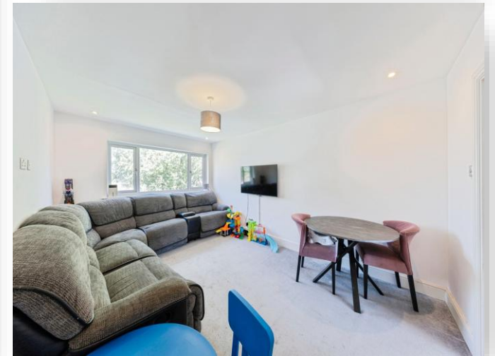
Ormonde, Stantonbury, Milton Keynes, MK14 6DH