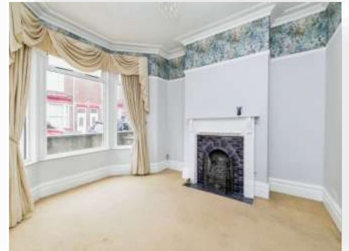
Coleridge Avenue, Hartlepool TS25 5AA