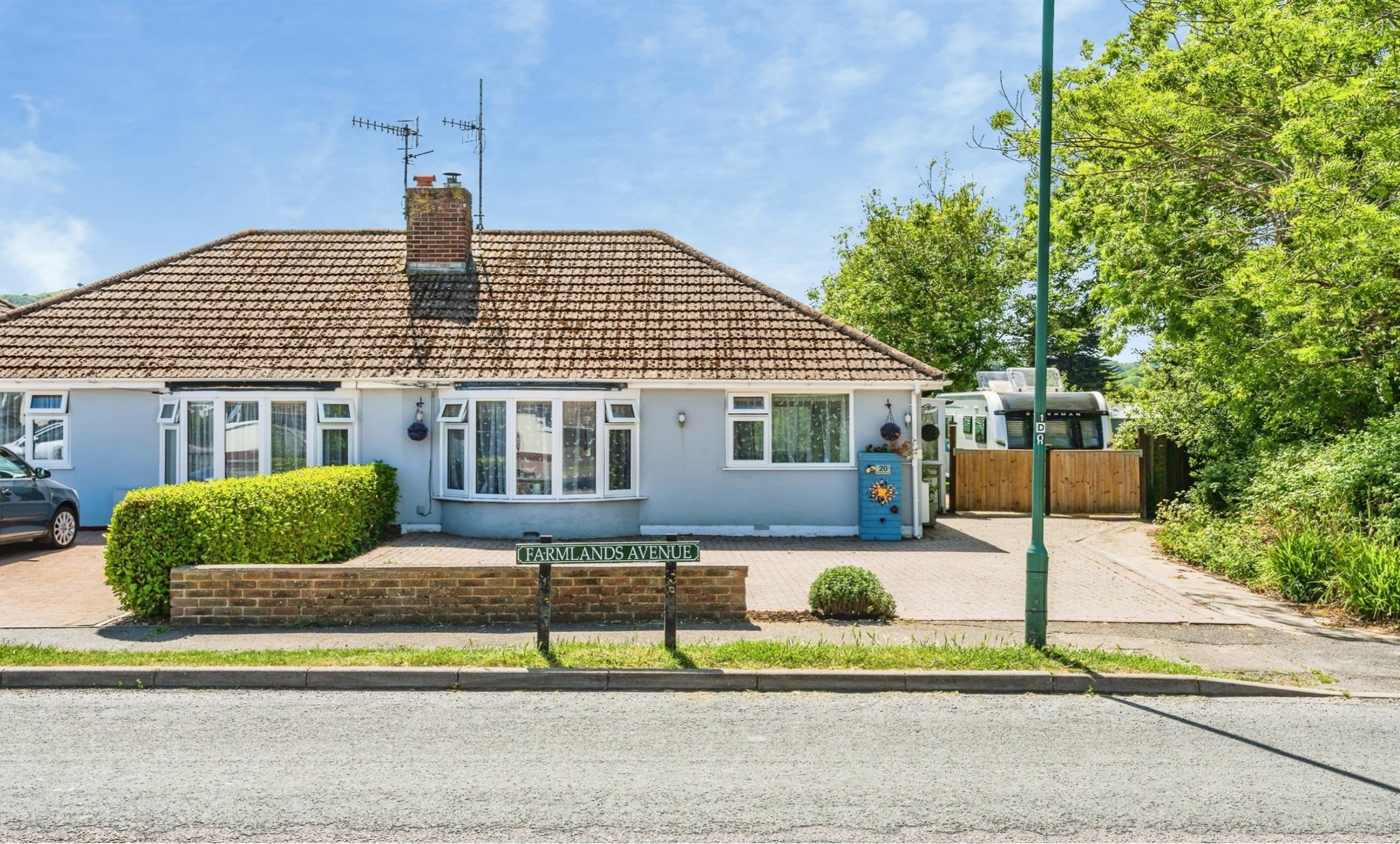
Farmlands Avenue, Polegate BN26 5LL