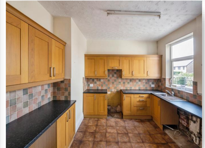
Park Road, Mexborough S64 9PH