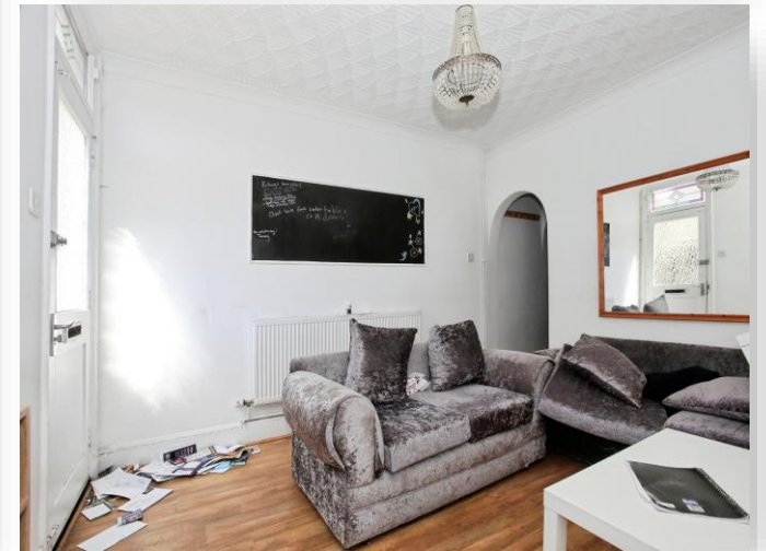
Star Road, Peterborough PE1 5EZ