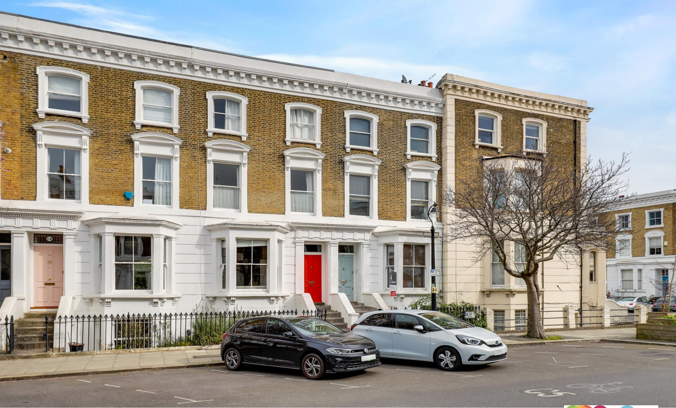
Aldebert Terrace, London SW8