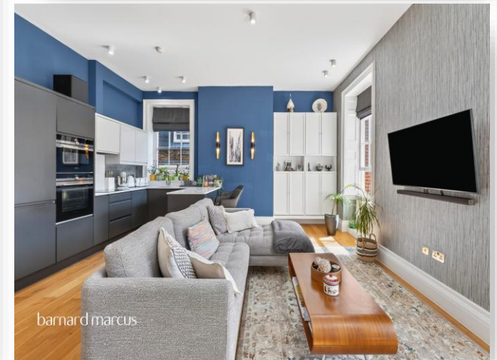
Ashley House, Ashley Road, Epsom KT18 5AZ